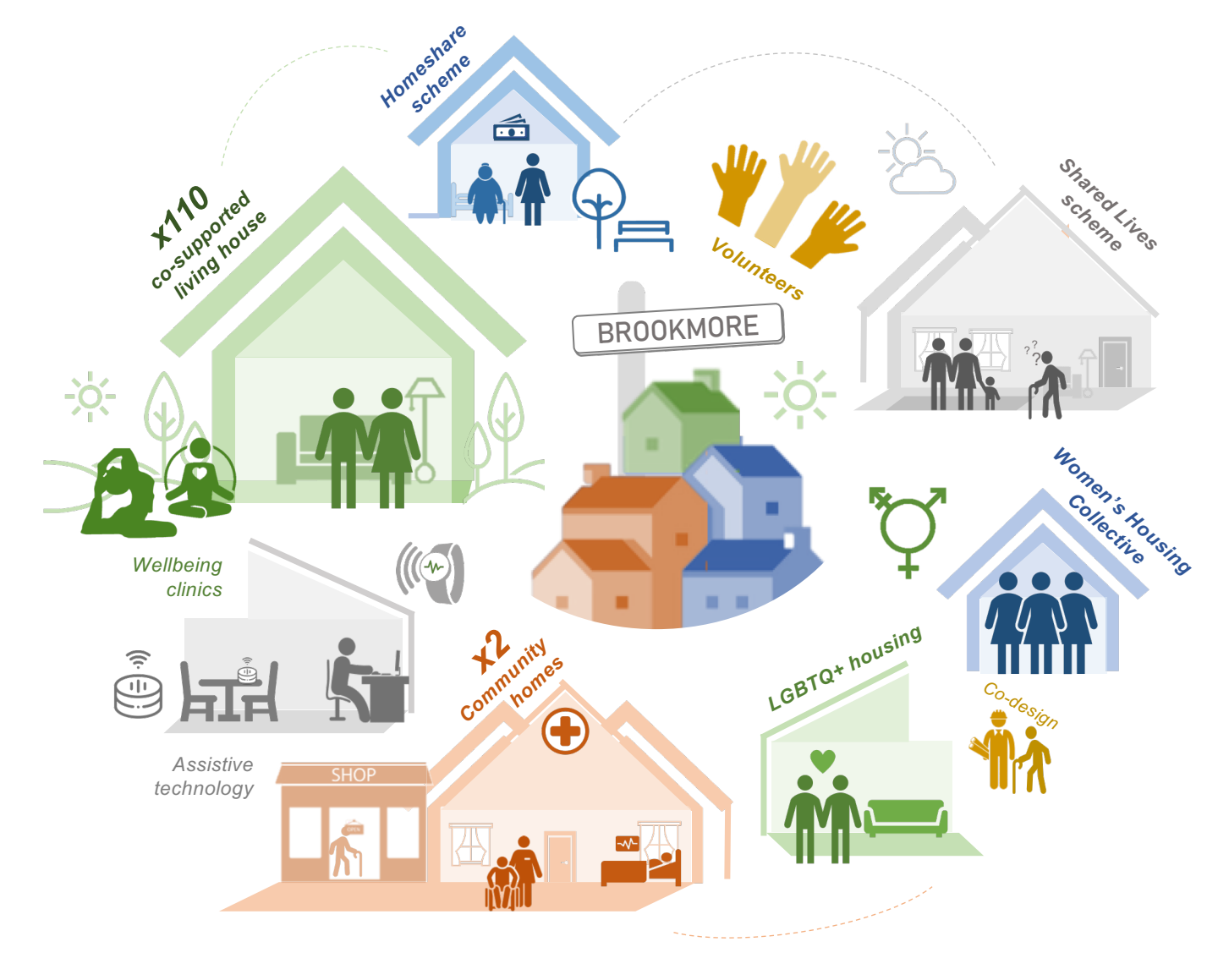
Figure 1: The Brookmore 2031 vision

If we are holistic in our thinking and actions, there is the potential to transform whole communities in the future through housing with care and support. The Commission worked with the co-production collective (a steering group of people with lived experience of different aspects of social care) to envision what we wanted a future place to look like, 10 years from now. The result was Brookmore, an imagined but also plausible place, we would all like to see in the future if we are ambitious for change. Through a place-based, integrated and co-produced approach to developing a vision and plan, and with sustained and focused action thereafter, we believe that Brookmore could be winning awards for the quality, choice and diversity of housing with care and support provision, and benefitting immensely from the growing health and wellbeing of its older population.